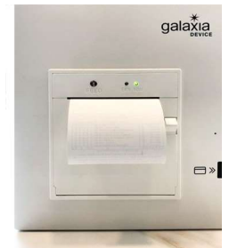
Automatically aligns when the cover is closed