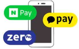
Simple / Mobile Payment