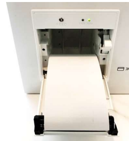
Insert new receipt paper