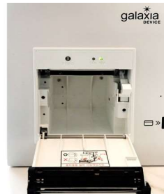
Remove the used receipt paper