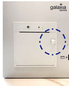
Open with a button

Quick and easy paper replacement in-store with a front-loading printer.